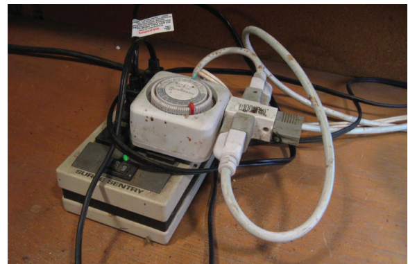
YOU FIGURE IT OUT!