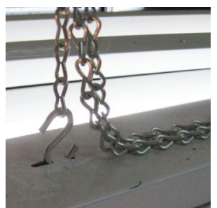
"S" HOOK AND CHAIN